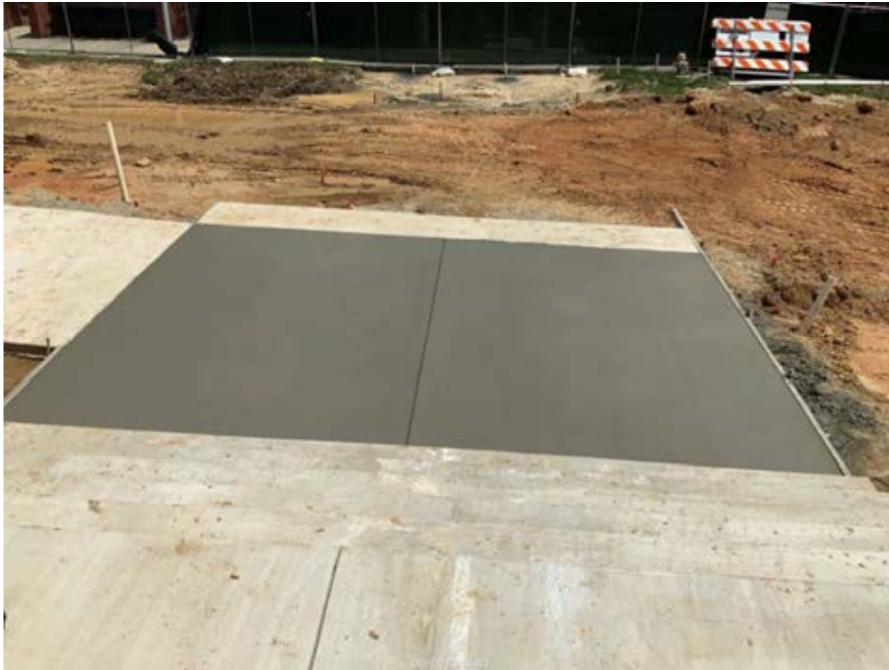
Place Plan South Concrete at Stairs