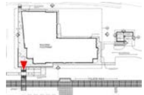
Location: Plan South