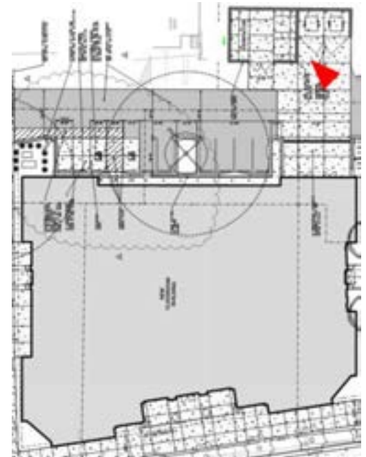
Location: Plan North