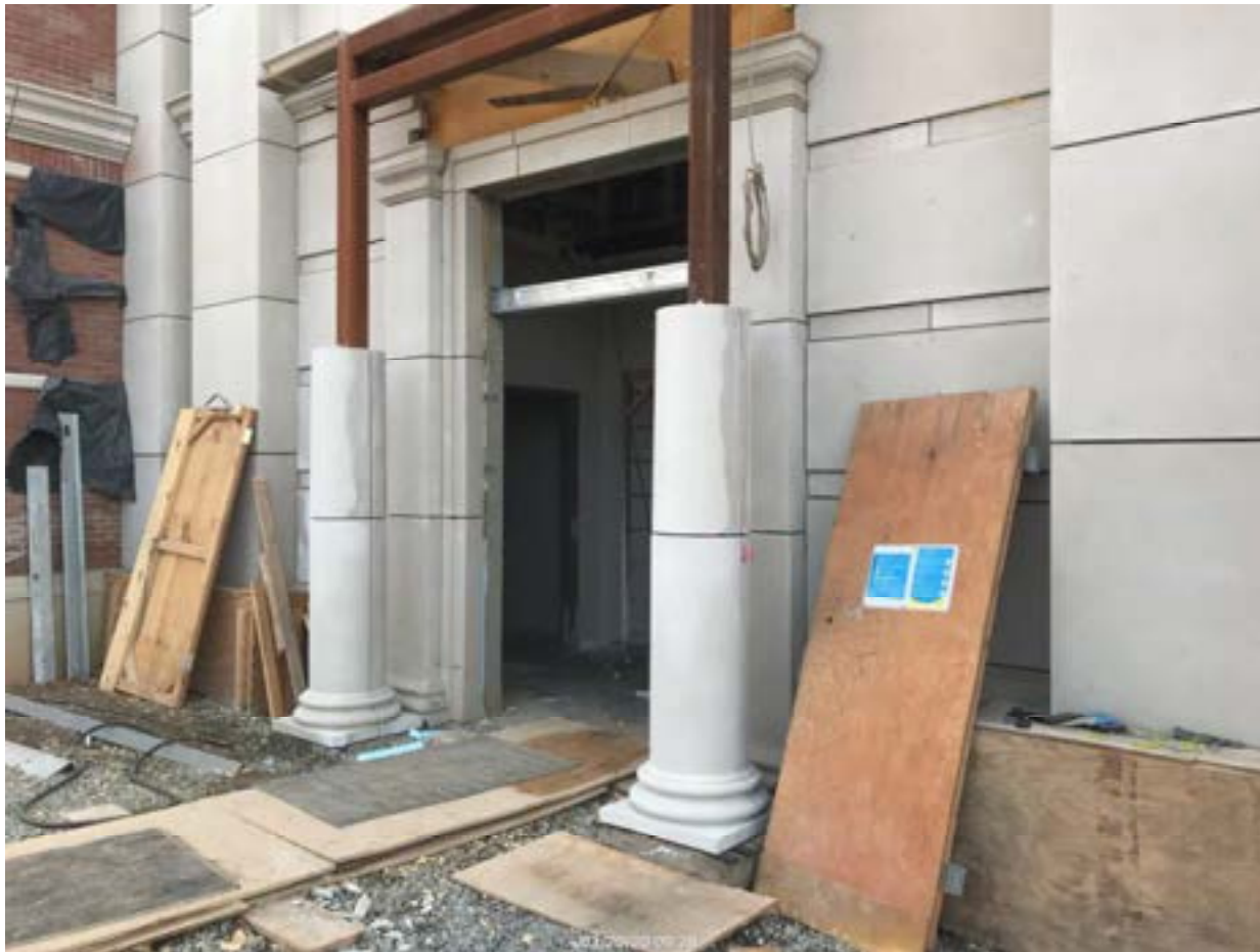
Set East Entrance Cast Stone Columns