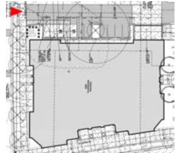
Location: Plan North