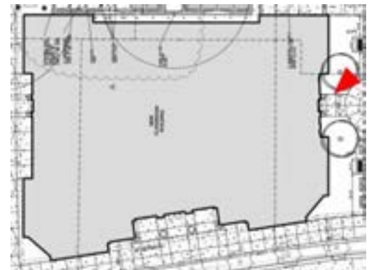
Location: East Elevation