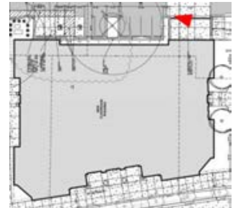
Location: Plan North