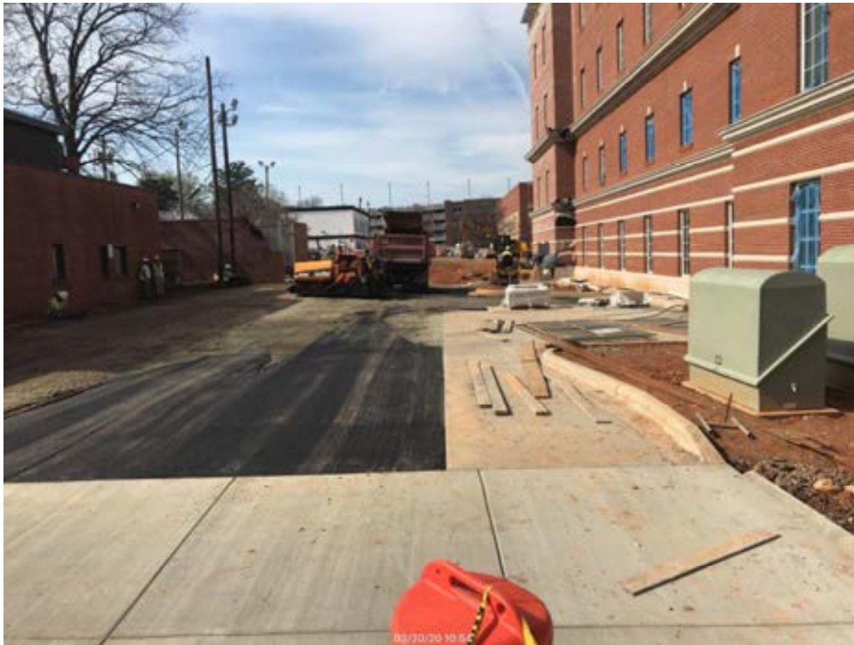
Begin Paving Parking Area