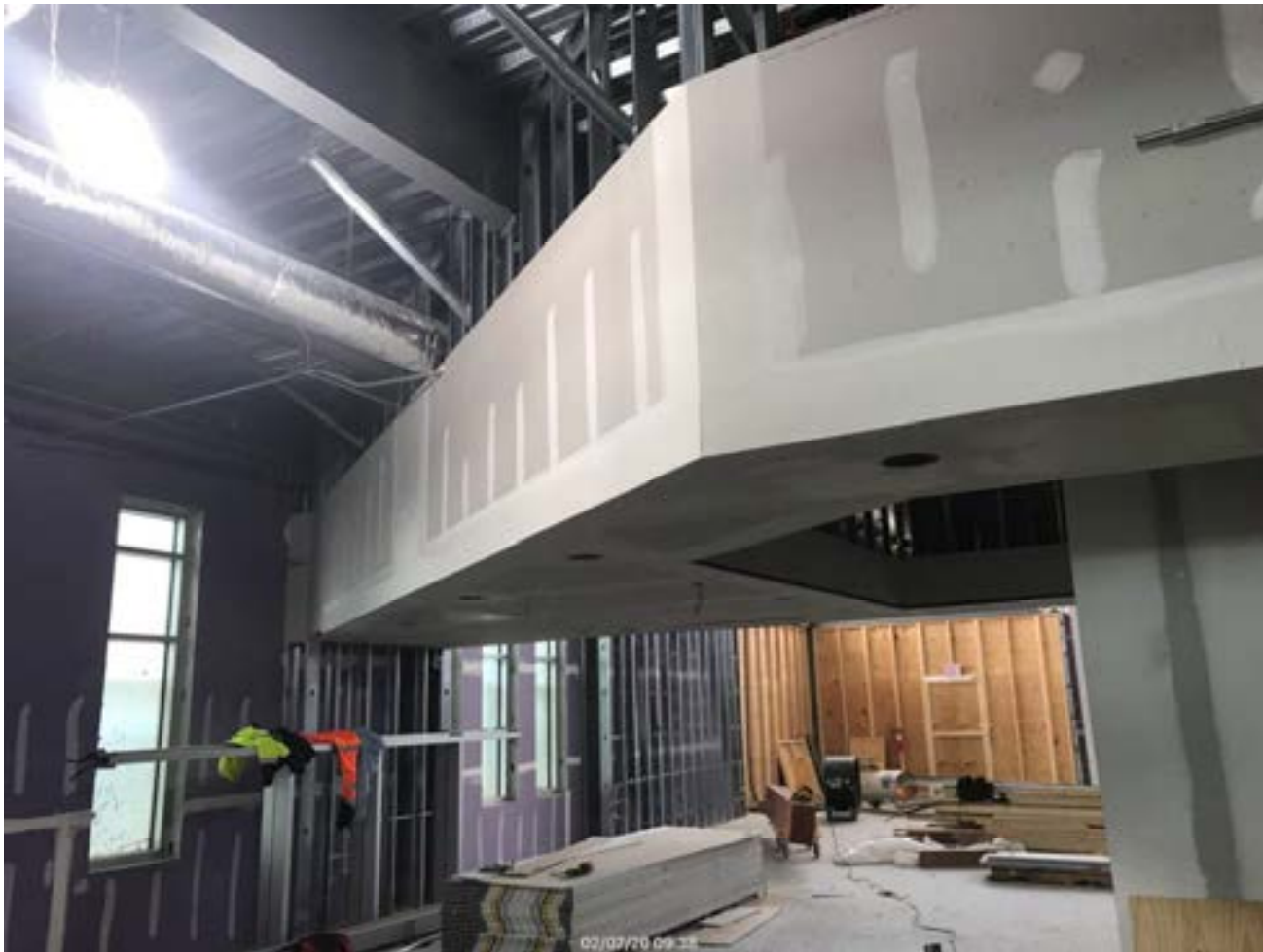
Hang and Tape Circulation Soffit