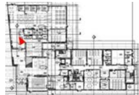
Location: Circulation 120