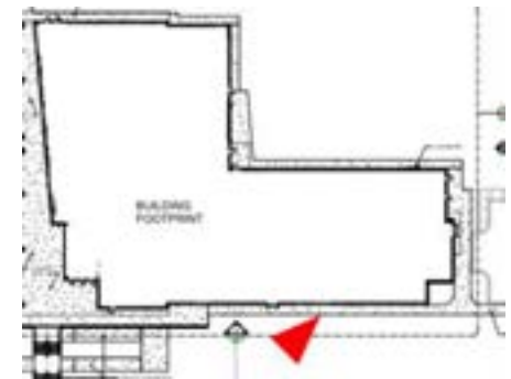
Location: East Elevation