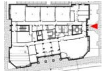
Location: East Elevation