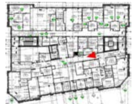
Location: Corridor 470