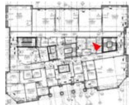
Location: Mens 280