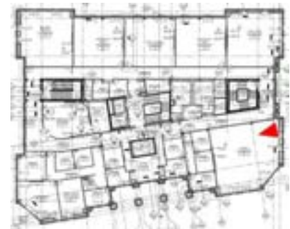
Location: Classroom 200