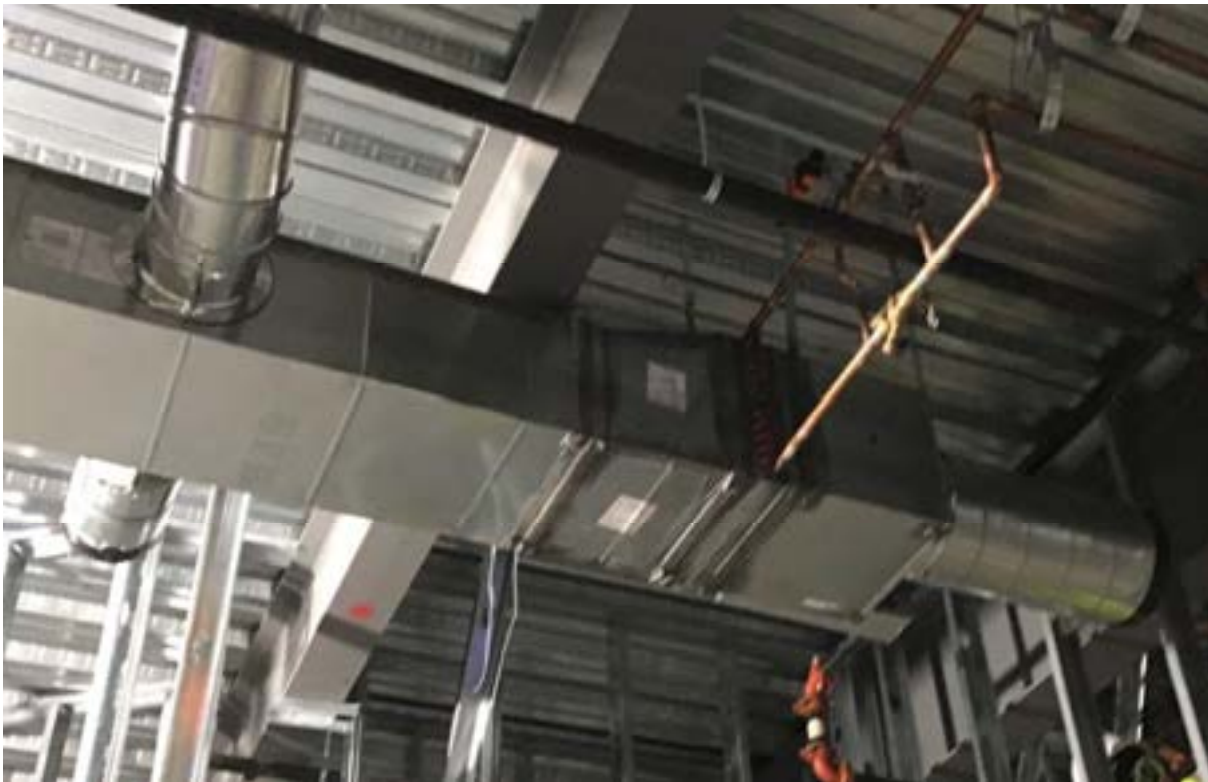
Begin Piping First Floor VAVs