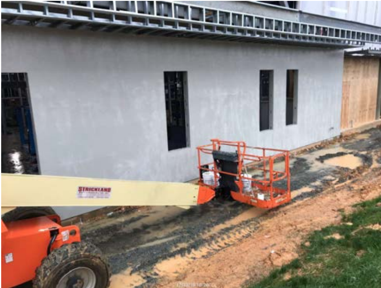
Complete Balance of Plan North Sheathing and Air Barrier System