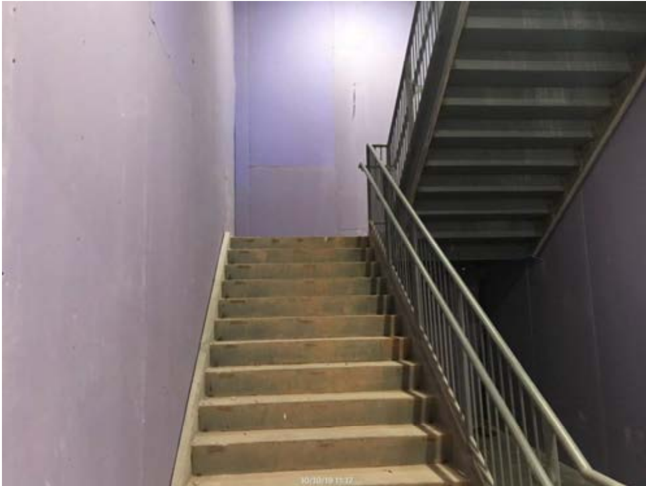
Begin Hanging Drywall at Stair 1