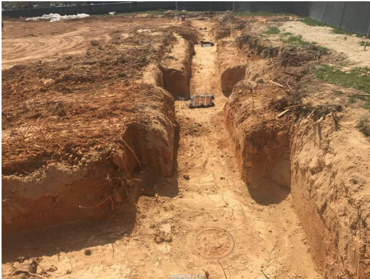
Backfilled Storm Sewer Trench