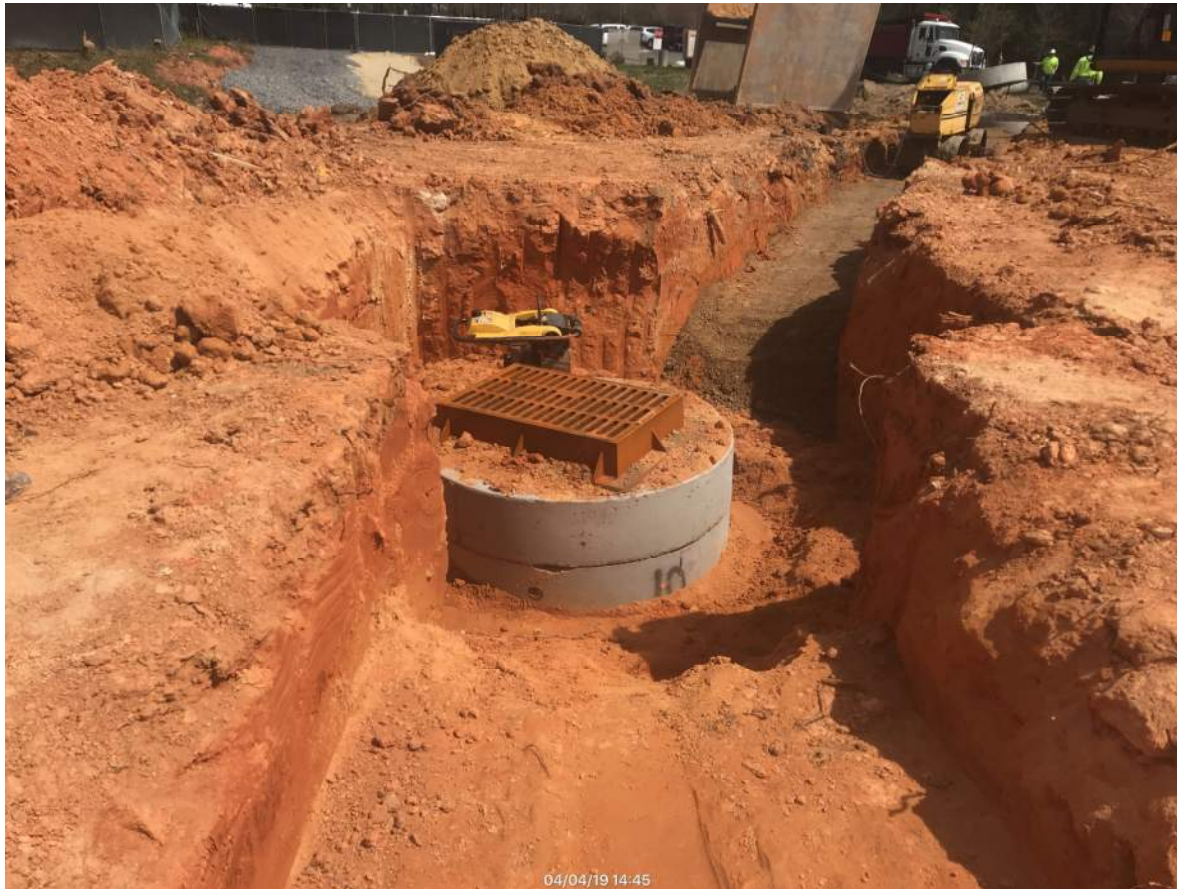
Backfilled Storm Sewer Trench